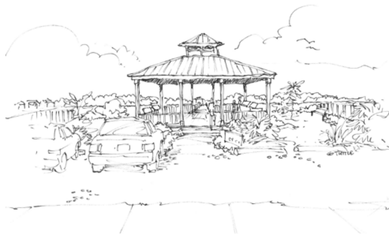
RENDERING OF PROPOSED Wetland Conservation Project Depicts Scaled down version of Jordan Blvd Pavilion