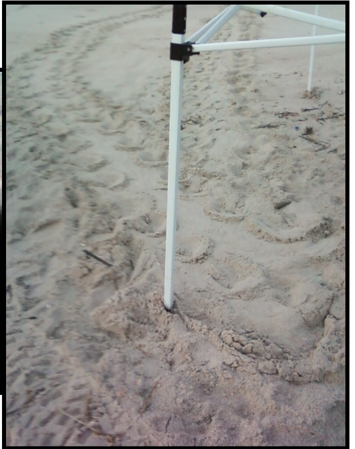
Some additional photos of a cabana "Hotel" left on the beach.